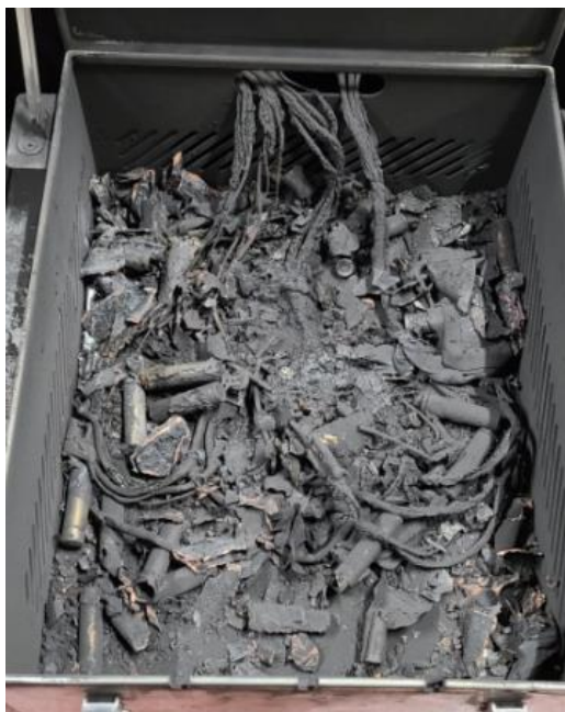
Figure 1. Results of fire and explosion of a B2 battery during T.7 Overcharge Testing

A number of packages containing LiBs arrived with dents on the outer box. However, since undamaged packages resulted in failures and damaged packages resulted in passing results, package conditions at receipt does not appear to correlate to the UN 38.3 testing results.